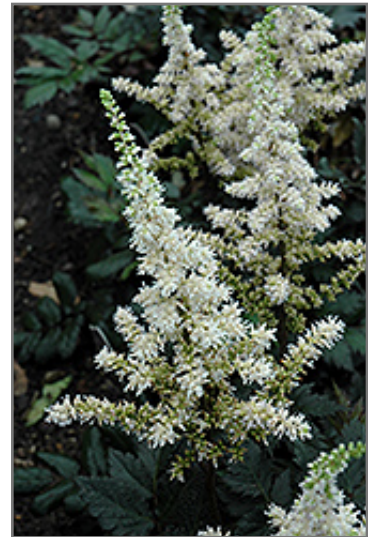
Visions in White Chinese Astilbe flowers