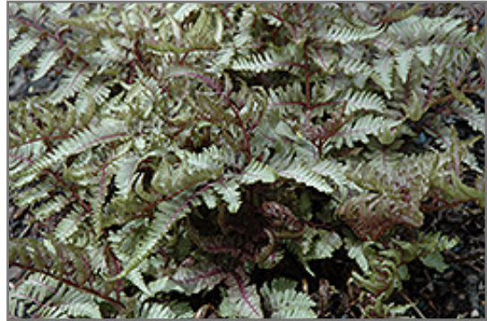
Red Beauty Painted Fern foliage